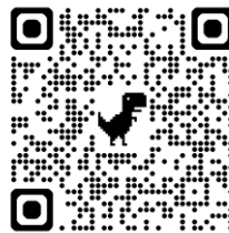
Young Minds- Exam Time Support for Parents

In Coventry and Warwickshire, for any urgent mental health concerns, contact the RISE Crisis Helpline available 24/7, by calling NHS 111. Alternatively, call 999 or visit A&E in an emergency, for example if medical attention is required.